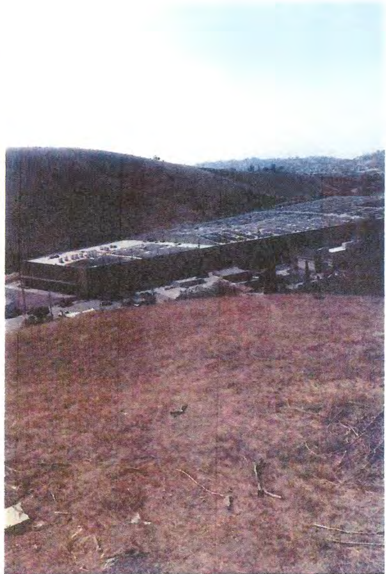
④ Approx 350 feet westerly of easterly PL looking southerly toward Mission Road