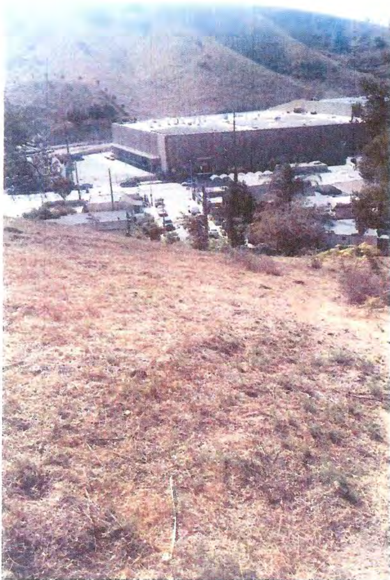
③ Approx. 260 feet westerly of easterly PL Looking southeasterly toward Superior Court