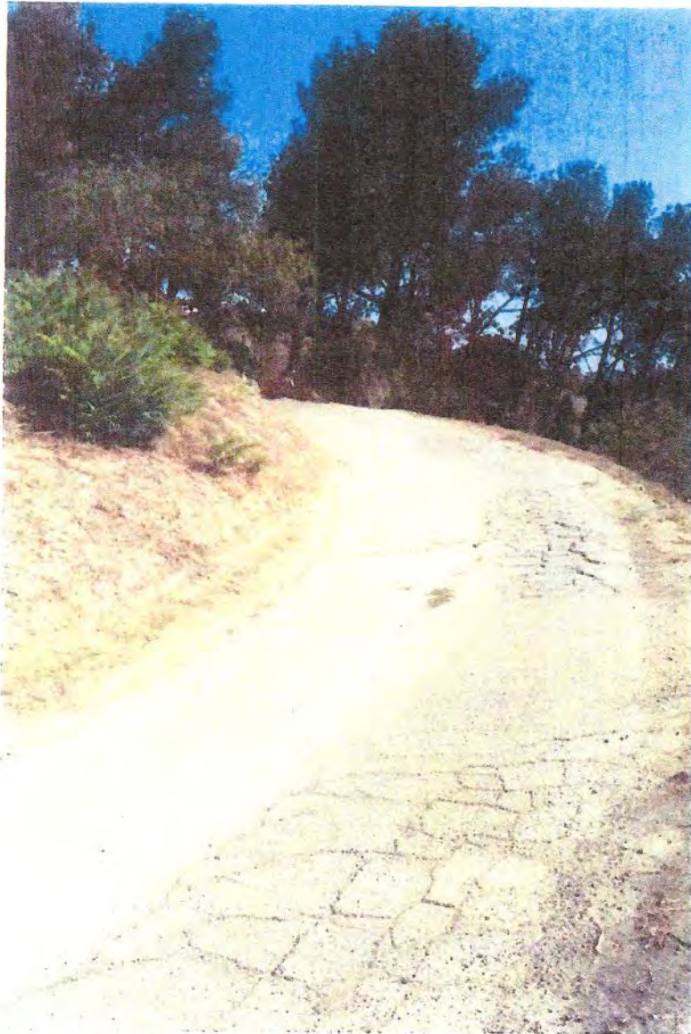
⑤ Along private road approx. 150 feet southerly of northerly R looking northerly toward Rising Drive