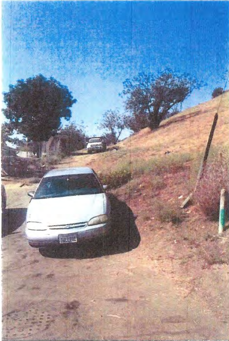
① Northeastly corner of property (intersection of Canto Drive and Onyx Drive) looking southwestly along R