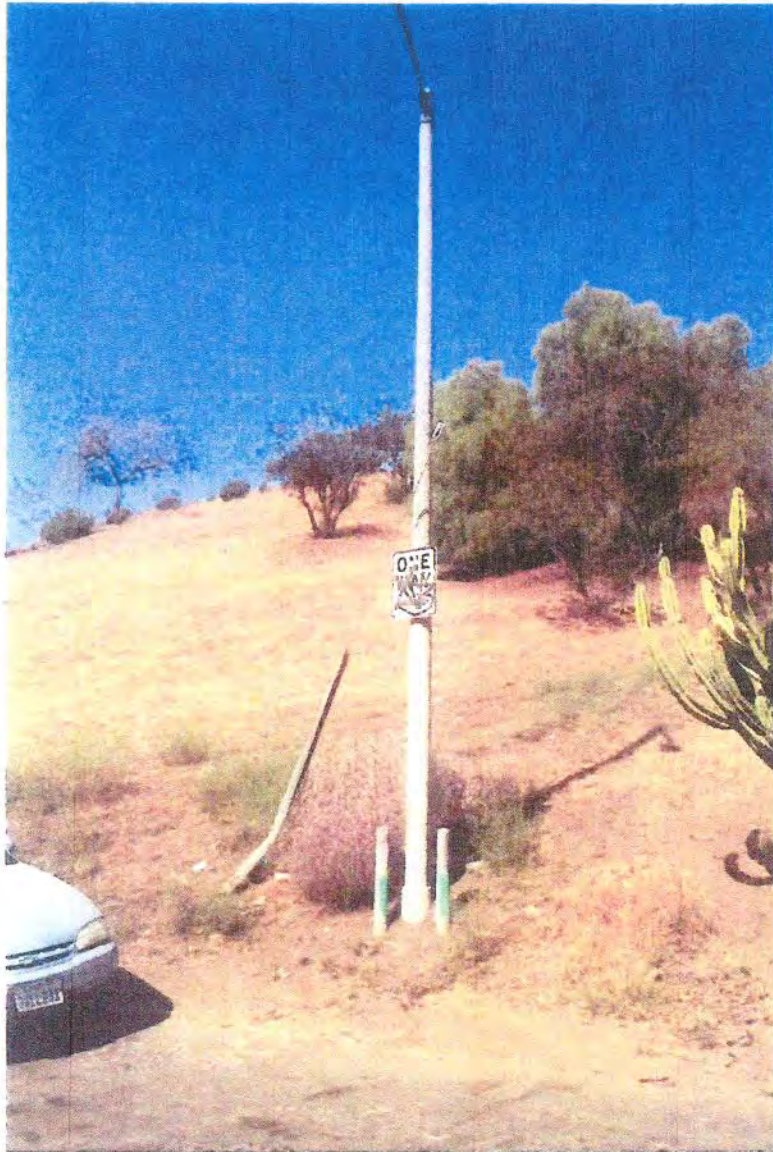
① Northeastly corner of property (intersection of Canto Drive and Onyx Drive) looking westerly onto the property